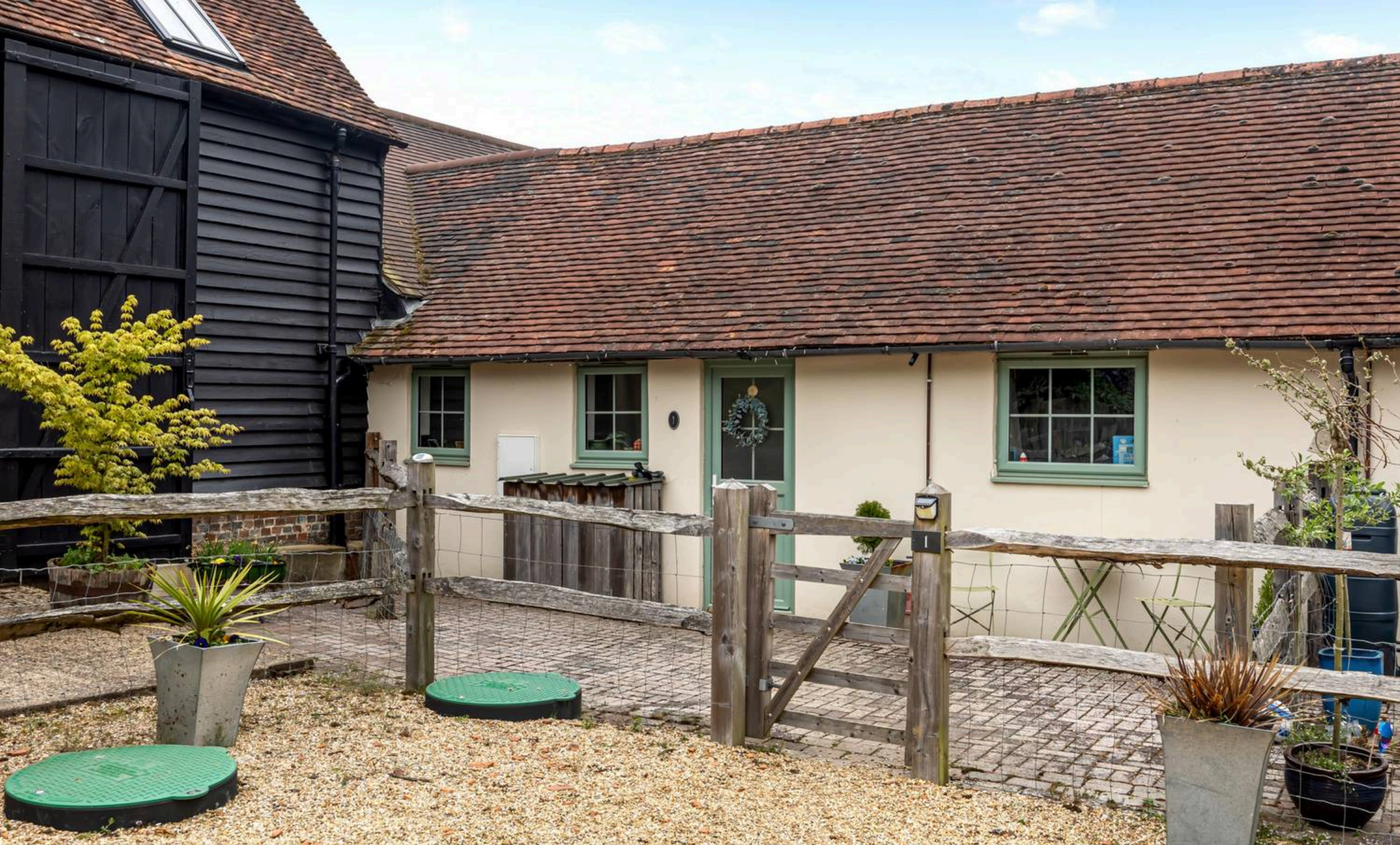
1 Groom Cottage Rose Hill, Isfield TN22 5UH

£2,250 pcm MANSELL McTAGGART — Trusted since 1947 —