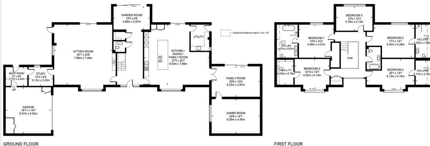
Illustration for identification purposes only, measurements are approximate, not to scale. www.enviromapltd.co.uk (ID922732)

Mansell McTaggart Uckfield Mansell McTaggart, 204-206 High Street – TN22 1RD 01825 760770 uf@mansellmctaggart.co.uk www.mansellmctaggart.co.uk/branch/uckfield