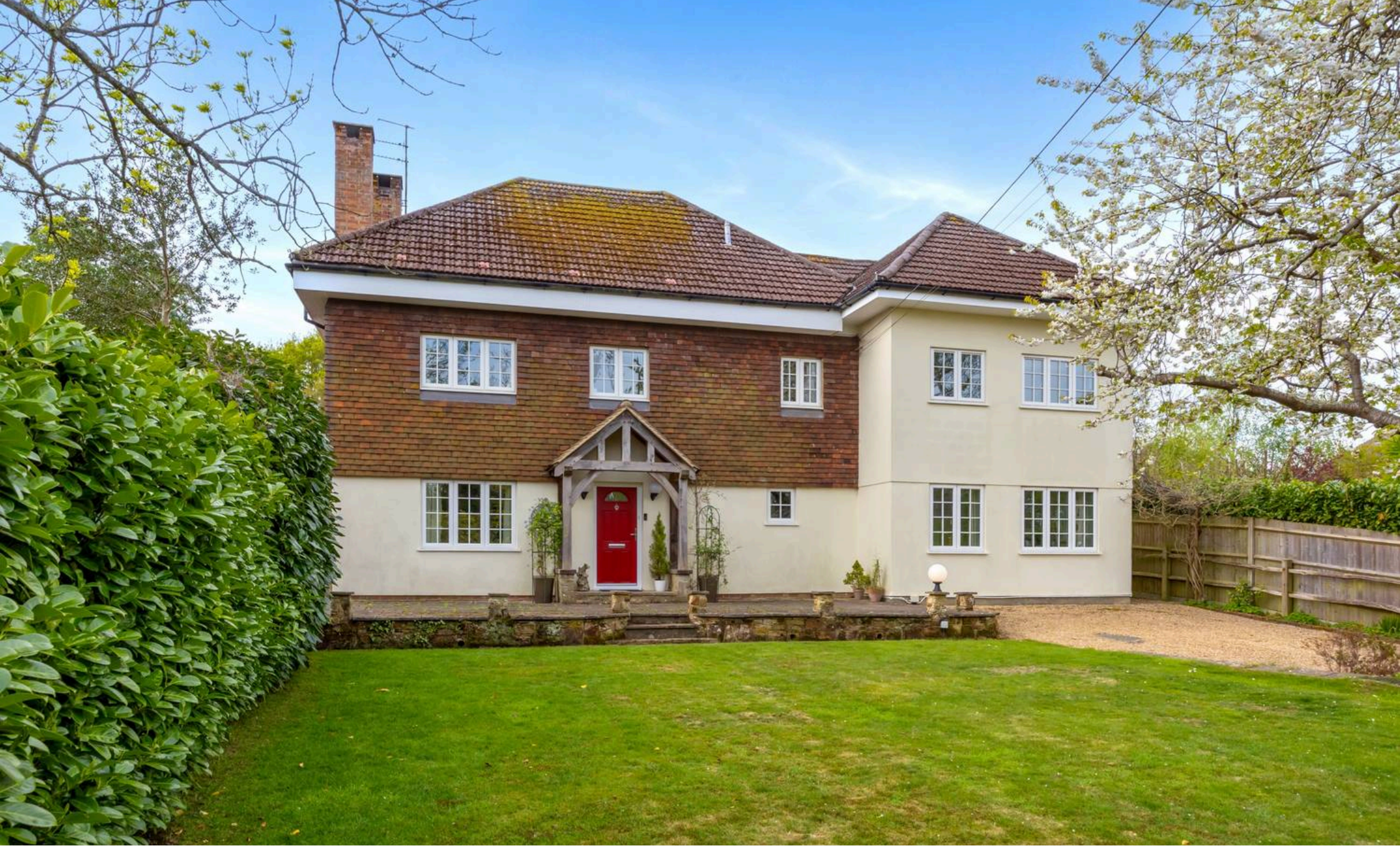
Hill House, Maresfield. TN22 3DP Uckfield

£1,200,000 MANSELL McTAGGART — Trusted since 1947 —