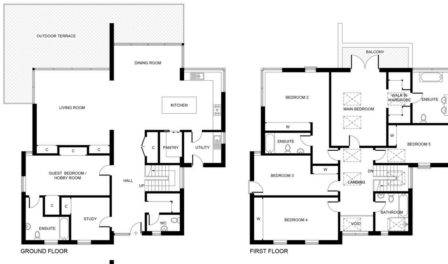
Illustration for identification purposes only, measurements are approximate, not to scale. (ID1185465)

Approximate Gross Internal Area = 3326 sq ft / 309.0 sq m