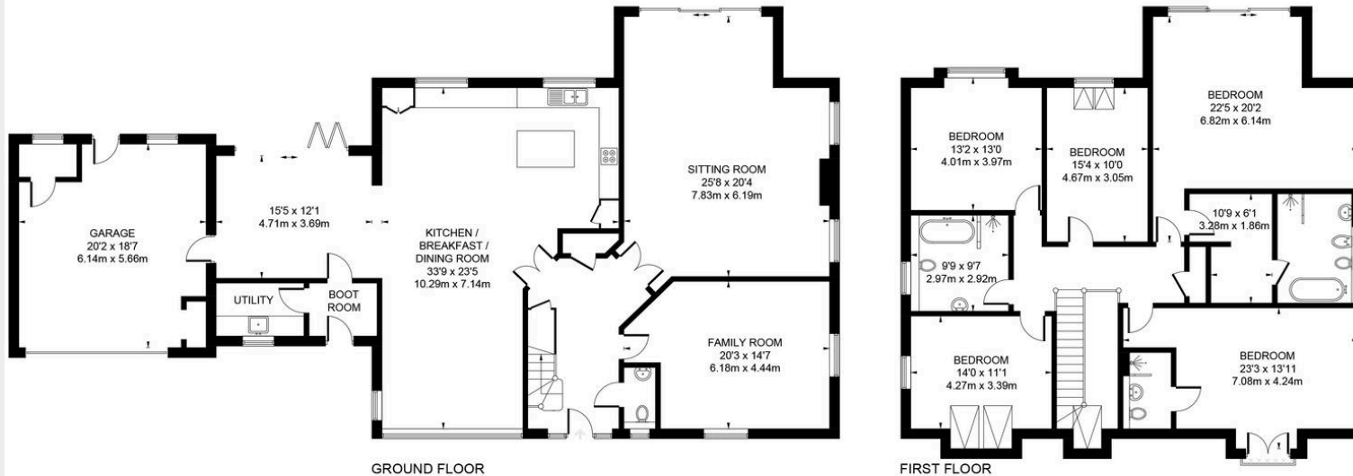
Illustration for identification purposes only, measurements are approximate, not to scale. www.enviromapitd.co.uk (ID922731)