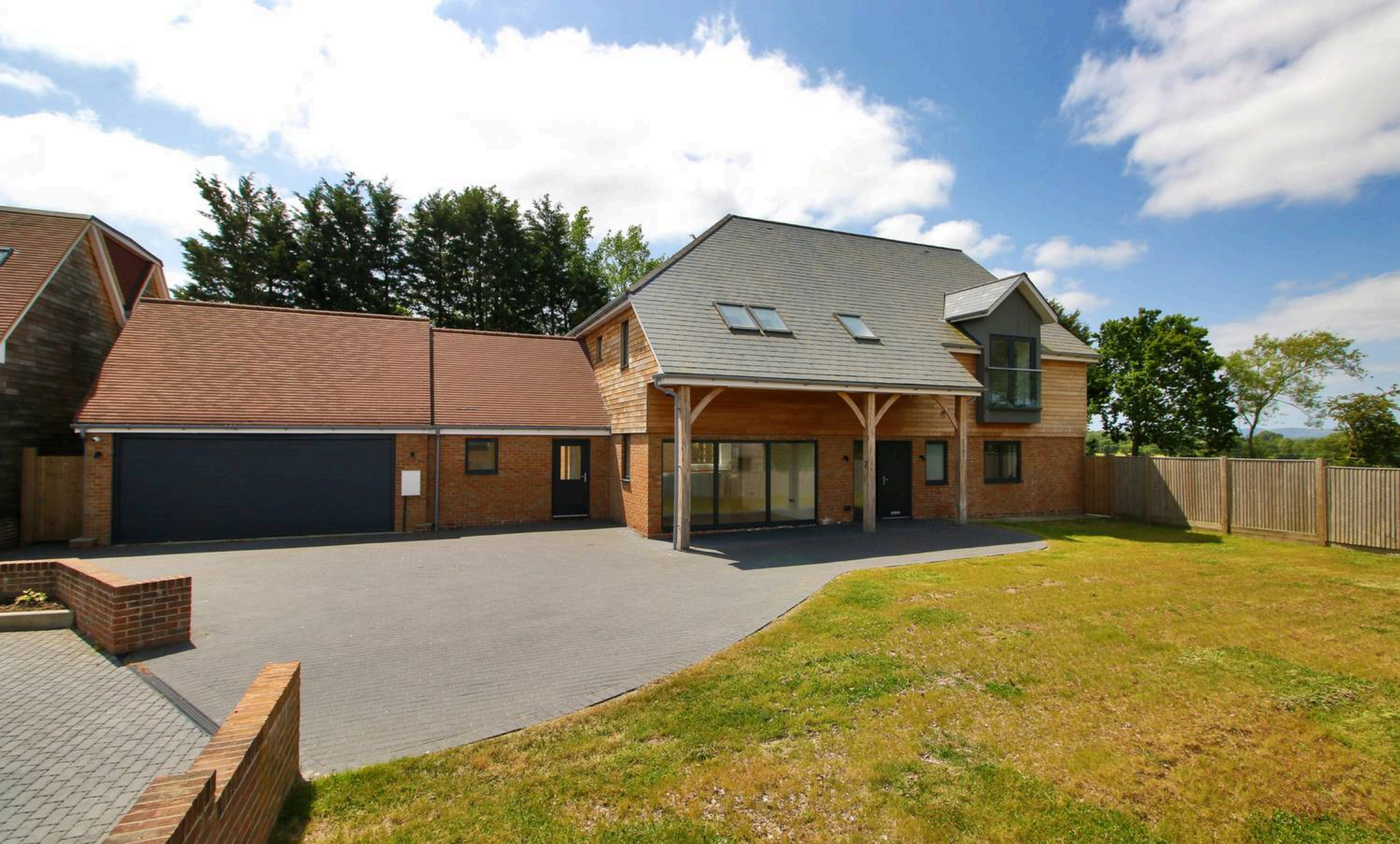
2 Oakview Place, Little Horsted Uckfield

£1,500,000 MANSELL McTAGGART — Trusted since 1947 —