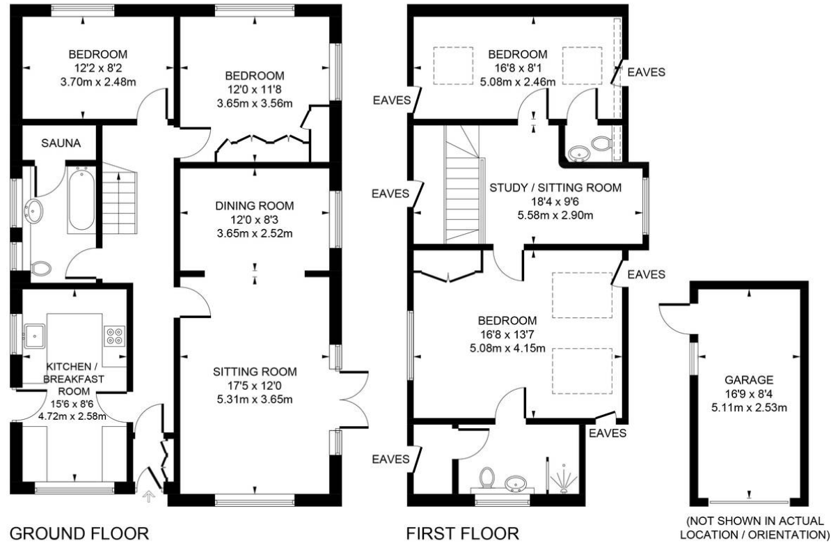
Illustration for identification purposes only, measurements are approximate, not to scale. www.enviromapLtd.co.uk (ID1114524)