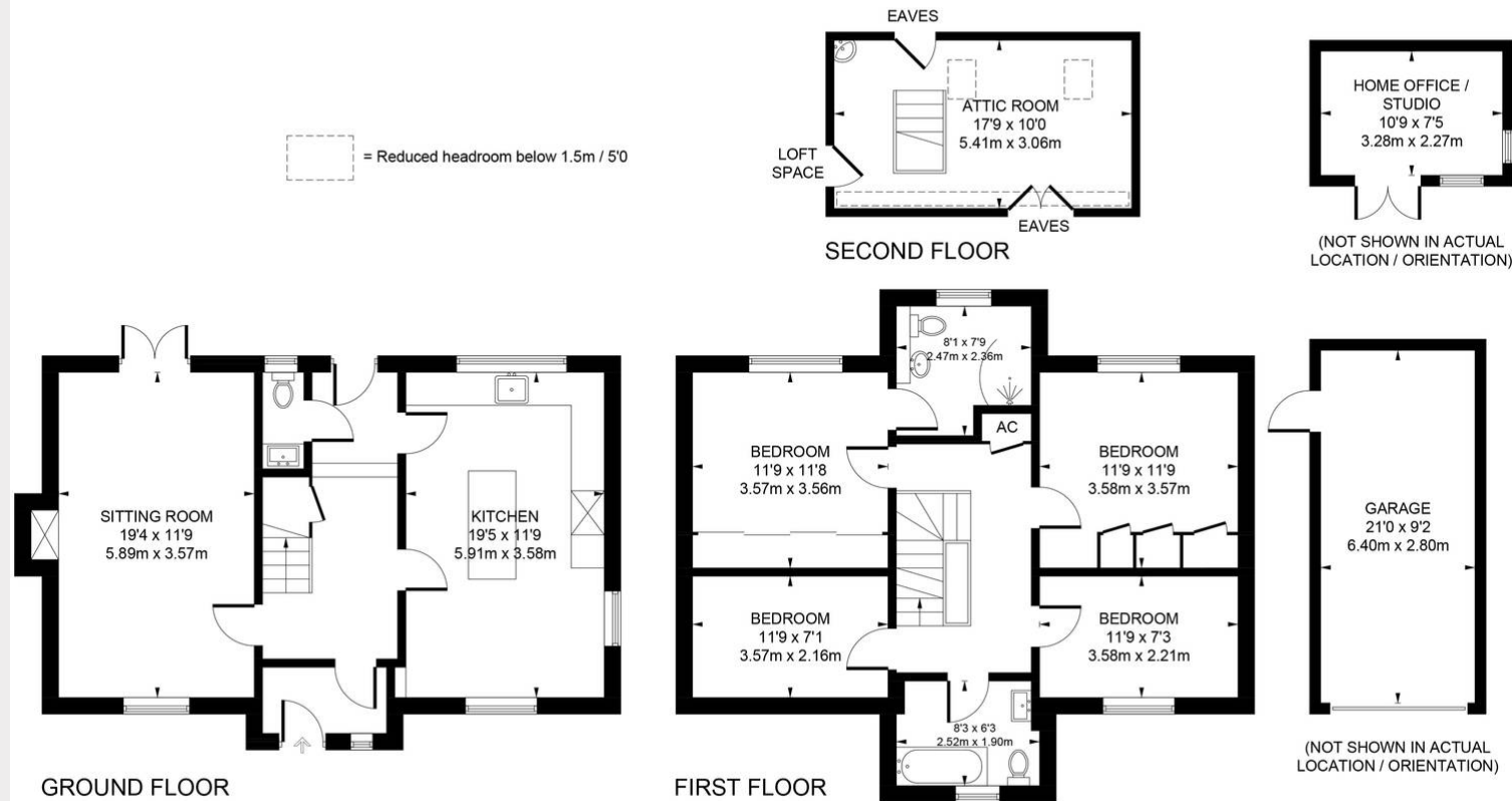
Illustration for identification purposes only, measurements are approximate, not to scale. www.enviromapLtd.co.uk (ID1114469)

Approximate Gross Internal Area = 142.7 sq m / 1536 sq ft Home Office / Studio / Garage = 25.3 sq m / 272 sq ft Total = 168.0 sq m / 1808 sq ft