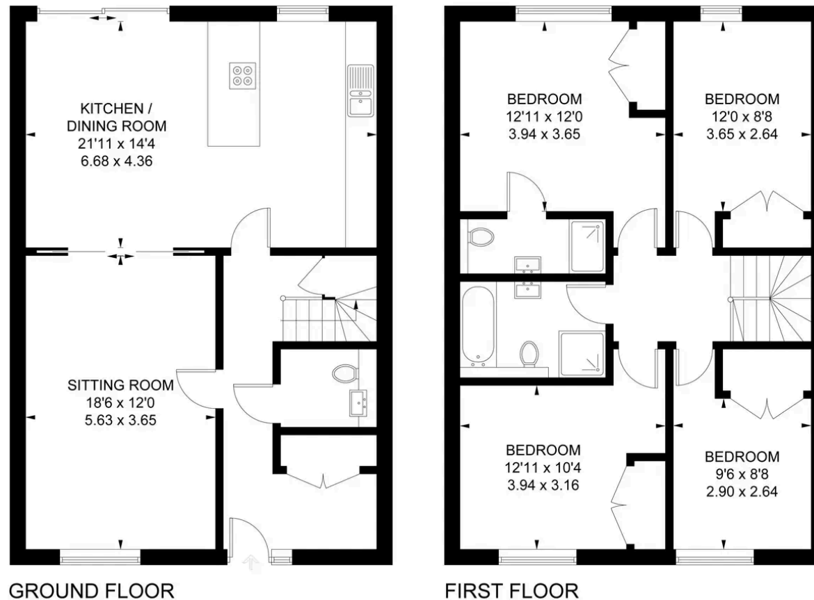
Illustration for identification purposes only, measurements are approximate, not to scale. (ID885413)

Approximate Gross Internal Area = 135 sq m / 1454 sq ft