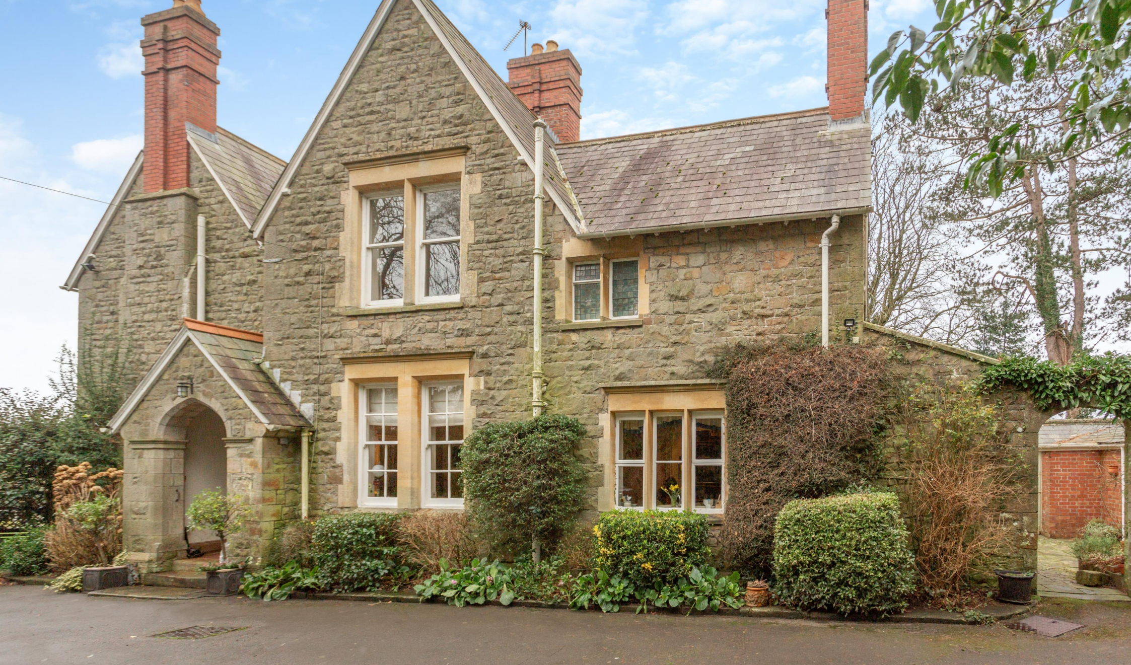
Church House St Arvans | Chepstow | Monmouthshire | NP16 6EU