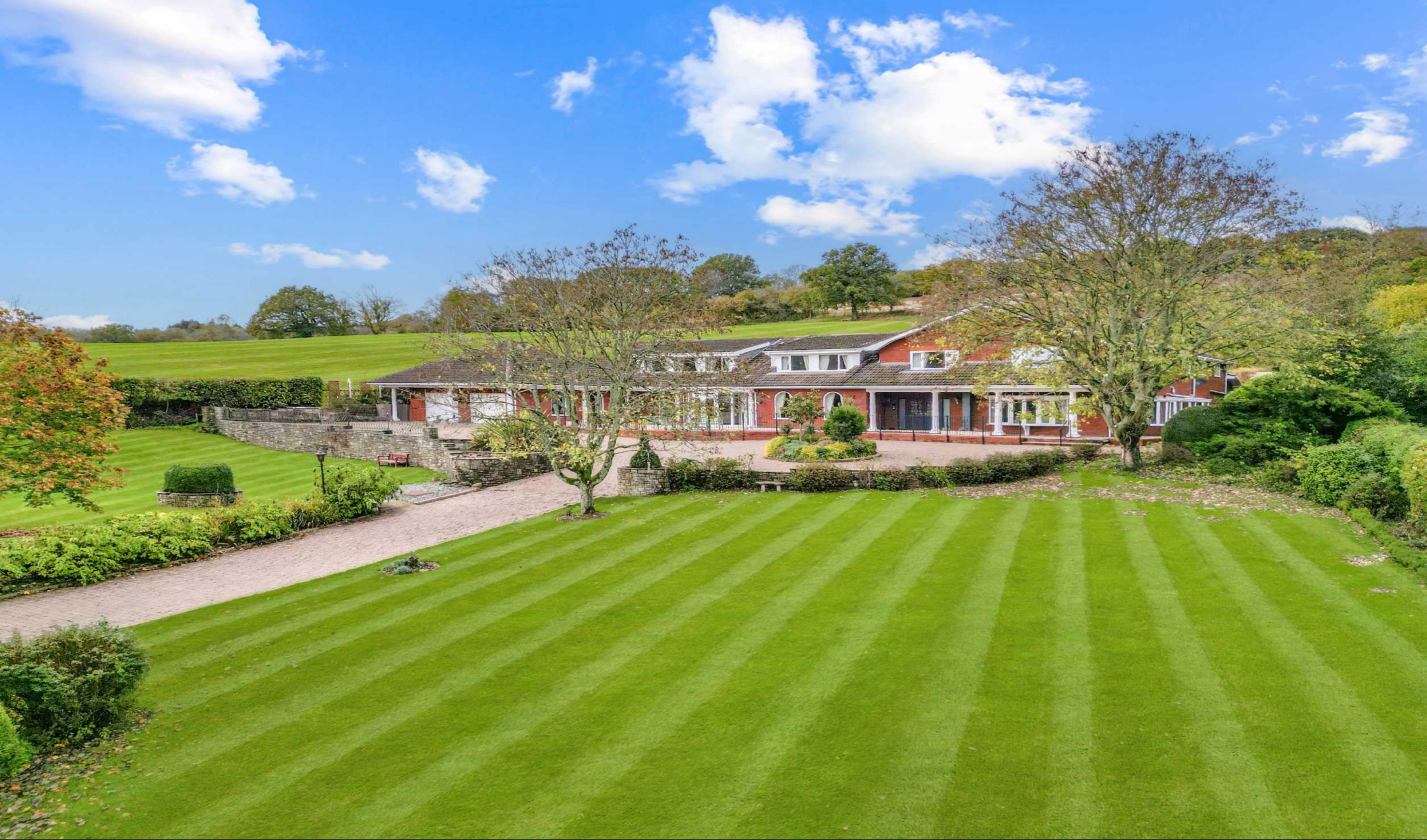
Springfield House Well Lane | Chepstow | Monmouthshire | NP16 6LP