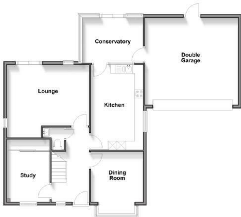
Ground Floor Approx. 100.0 sq. metres (1076.1 sq. feet)