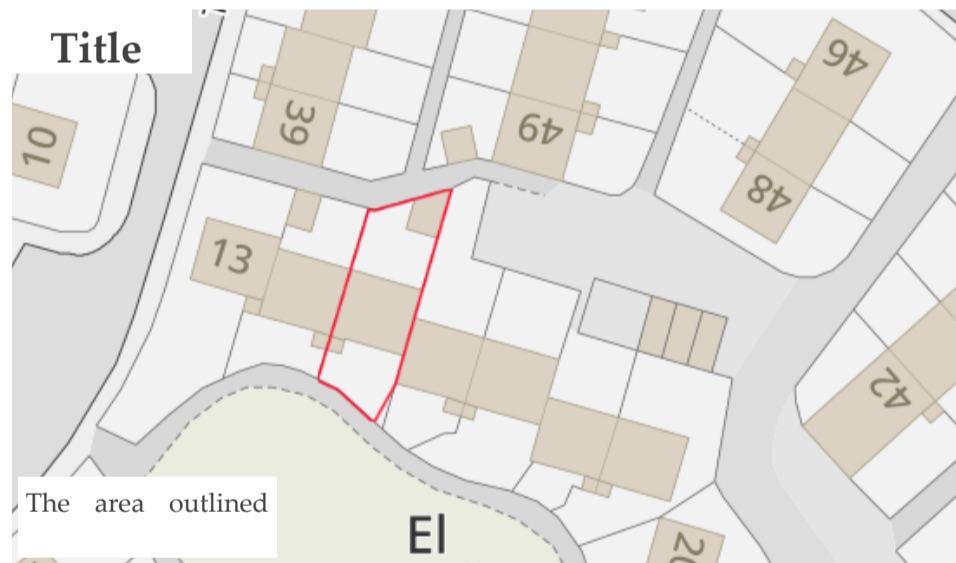
The area outlined