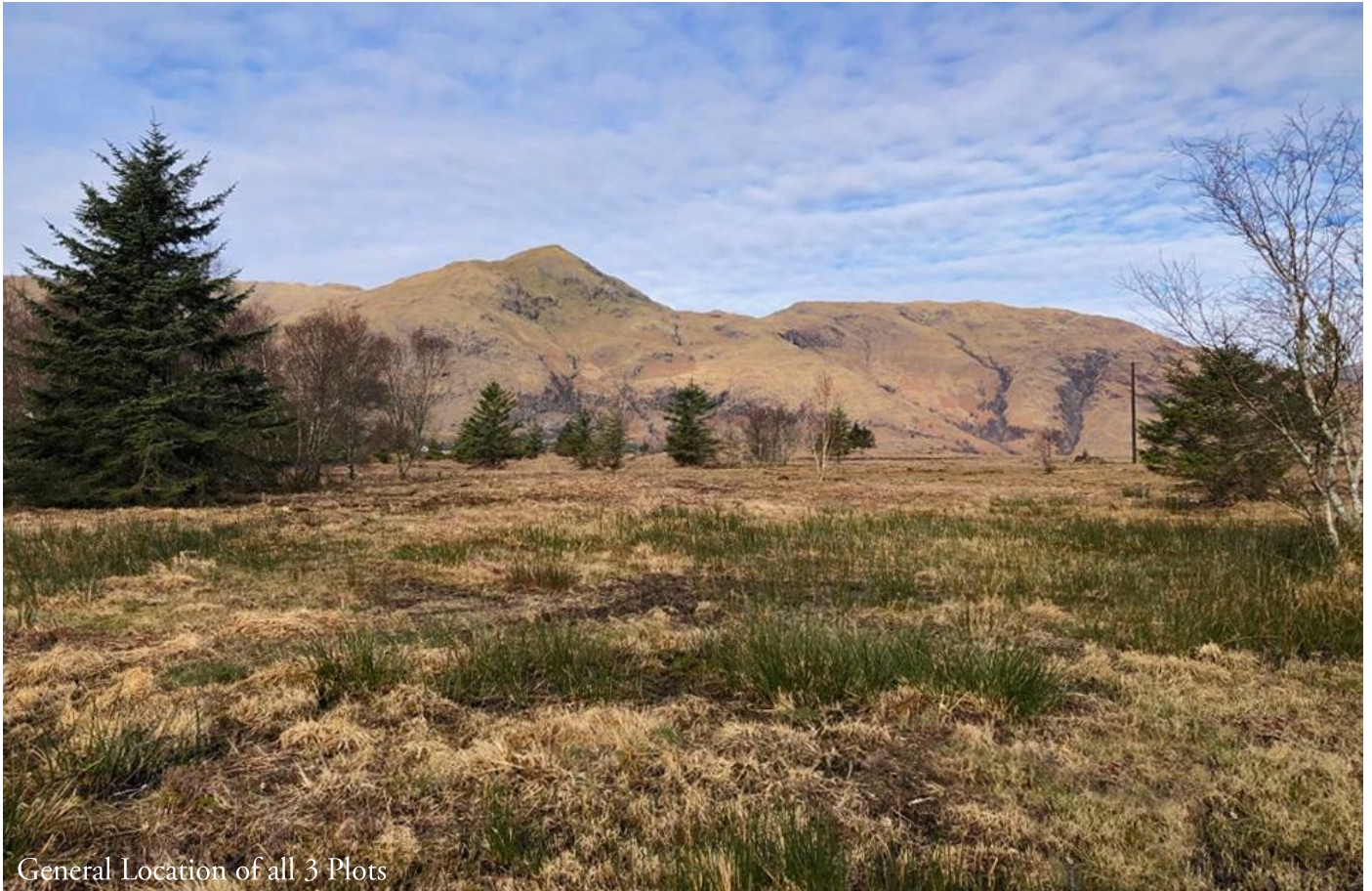
General Location of all 3 Plots