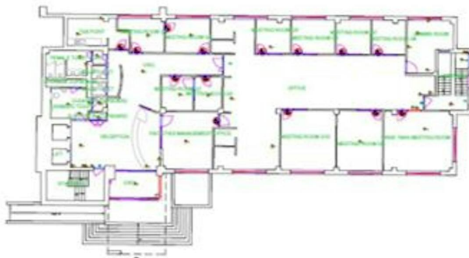
Main Building Ground Floor Main Entrance