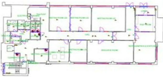
Main Building Basement