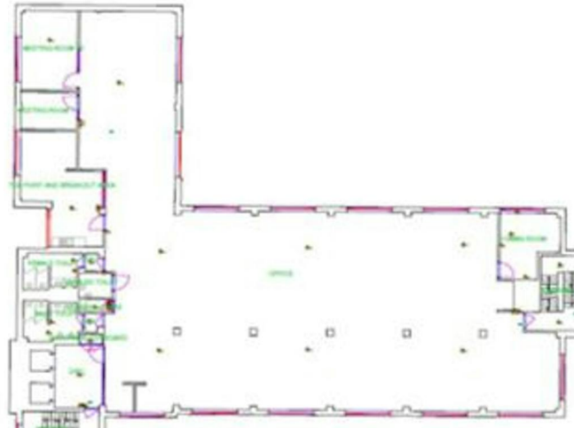
Main Building Third Floor