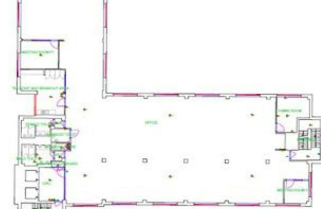
Main Building First Floor