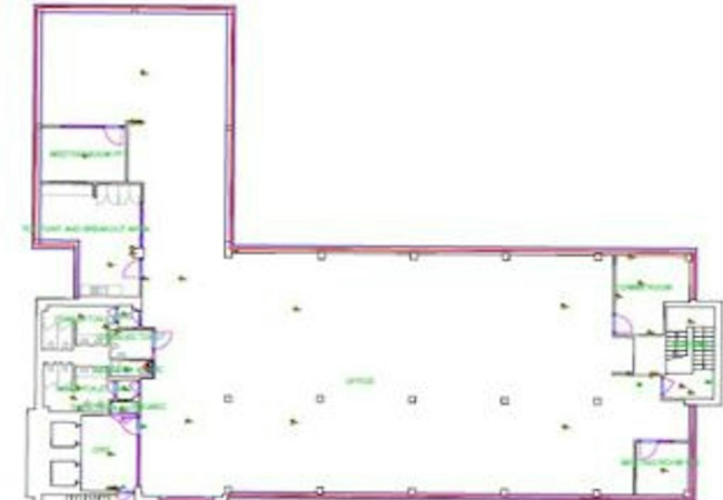
Main Building Fourth Floor