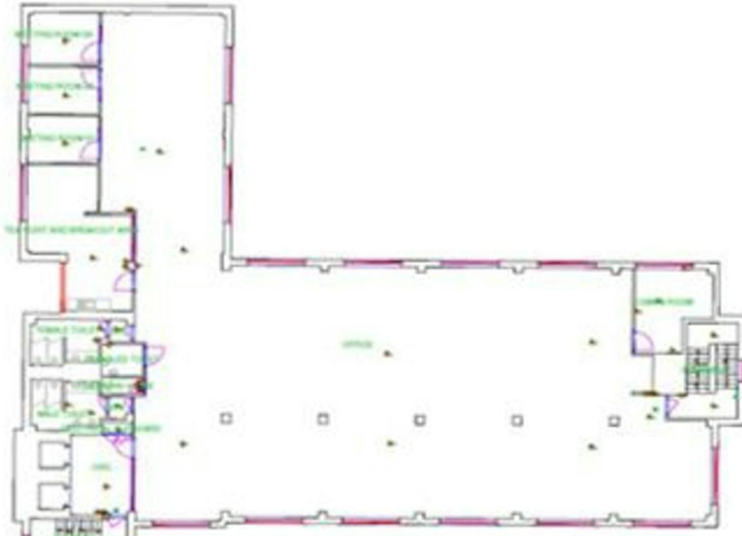
Main Building Second Floor