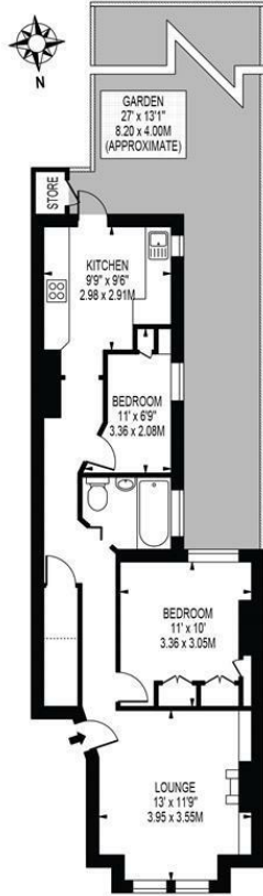
GROUND FLOOR FOR ILLUSTRATION PURPOSES ONLY

APPROXIMATE GROSS INTERNAL FLOOR AREA: 580 SQ FT - 53.88 SQ M (INCLUDING RESTRICTED HEIGHT AREA & EXCLUDING STORE) APPROXIMATE GROSS INTERNAL FLOOR AREA OF RESTRICTED HEIGHT: 14 SQ FT - 1.28 SQ M