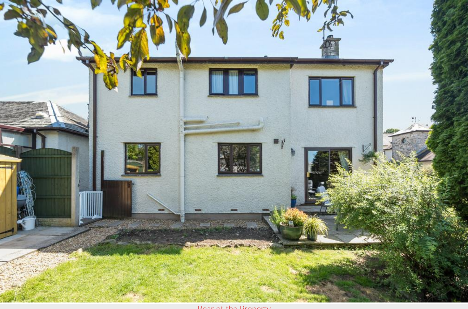
Rear of the Property