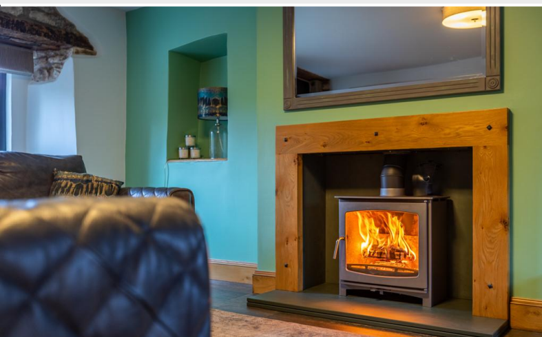
Wood Burning Stove