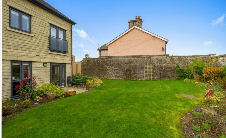
Private Patio and Communal Gardens