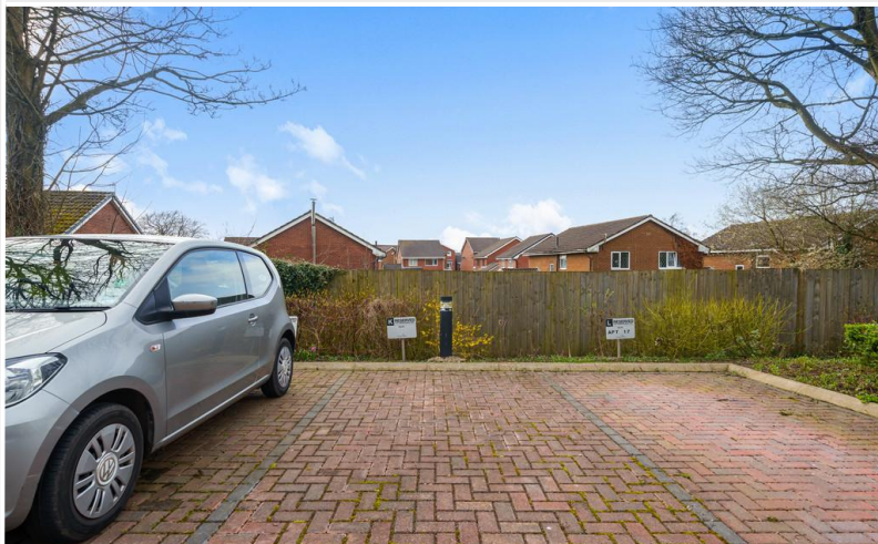
Allocated Parking Space