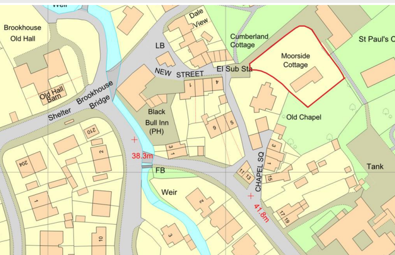
Ordnance Survey 01213236

Anti-Money Laundering Regulations Please note that when an offer is accepted on a property, we must follow government legislation and carry out identification checks on all buyers under the Anti-Money Laundering Regulations (AML). We use a specialist third-party company to carry out these checks at a charge of £42.67 (inc. VAT) per individual or £36.19 (ind. vat) per individual, if more than one person is involved in the purchase (provided all individuals pay in one transaction). The charge is non-refundable, and you will be unable to proceed with the purchase of the property until these checks have been completed. In the event the property is being purchased in the name of a company, the charge will be £120 (ind. vat).