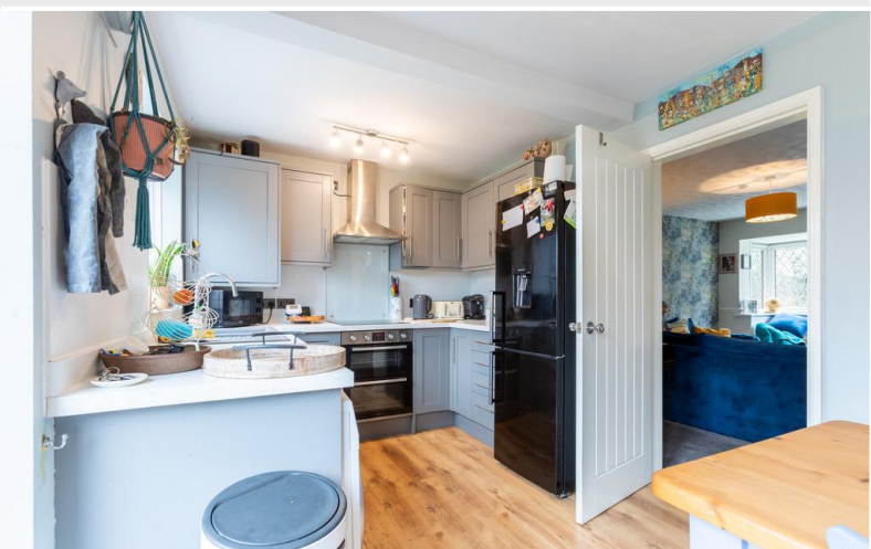
Kitchen Dining Room

Enter the home into the practical entrance hall with plenty of space for storing coats and shoes. To the right, the modern good-sized living room boasts plenty of room for all of your furnishings, complete with a bay window that offers a pleasant front-facing view.