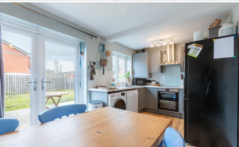
Kitchen Dining Room