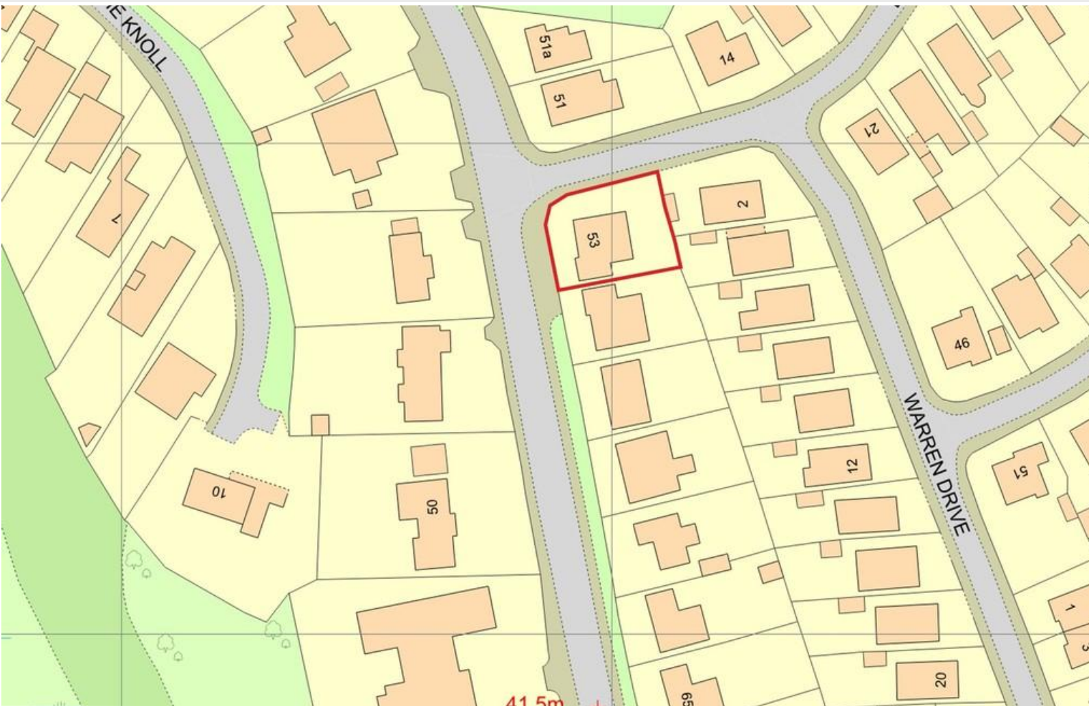
Ordnance Survey Map - 01187692

Request a Viewing Online or Call 01524 737727