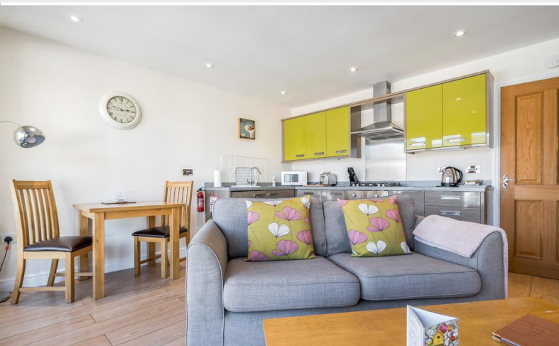
Open Plan Kitchen Dining Living Room