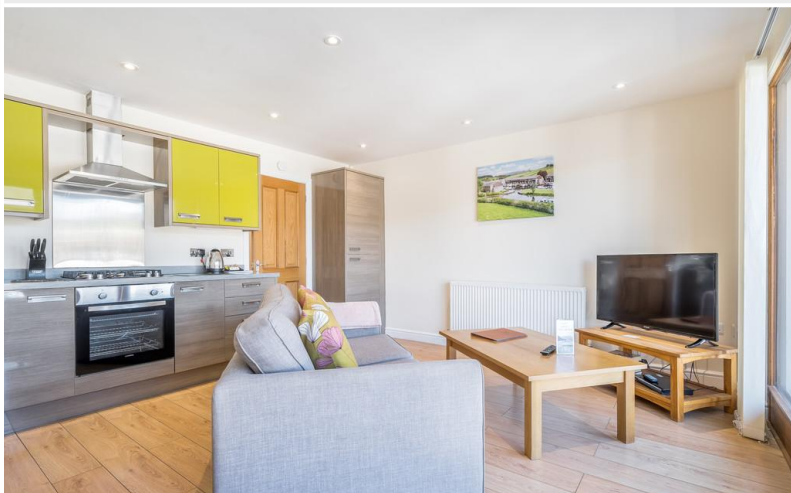
Open Plan Kitchen Dining Living Room