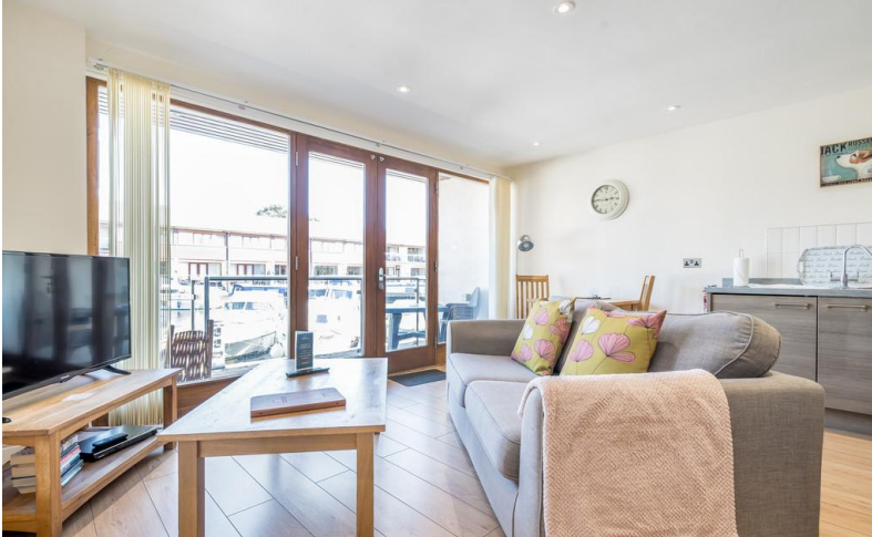
Open Plan Kitchen Dining Living Room