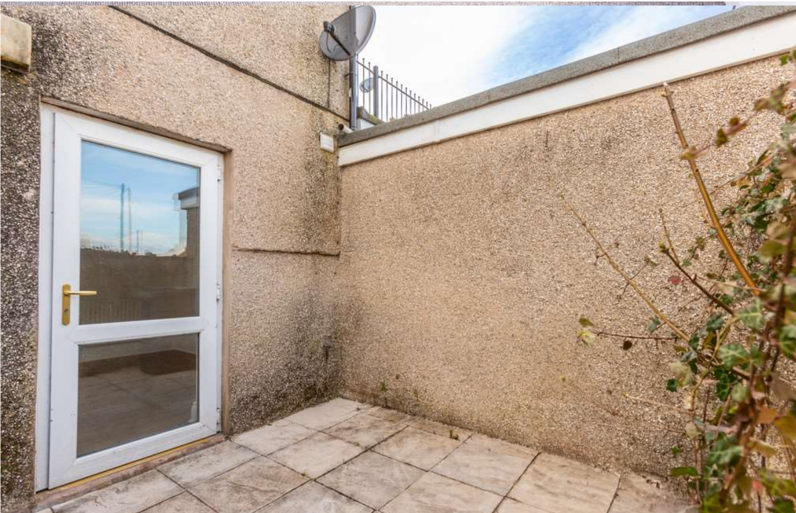
Walled Rear Yard