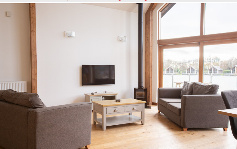
Open Plan Living Dining Kitchen