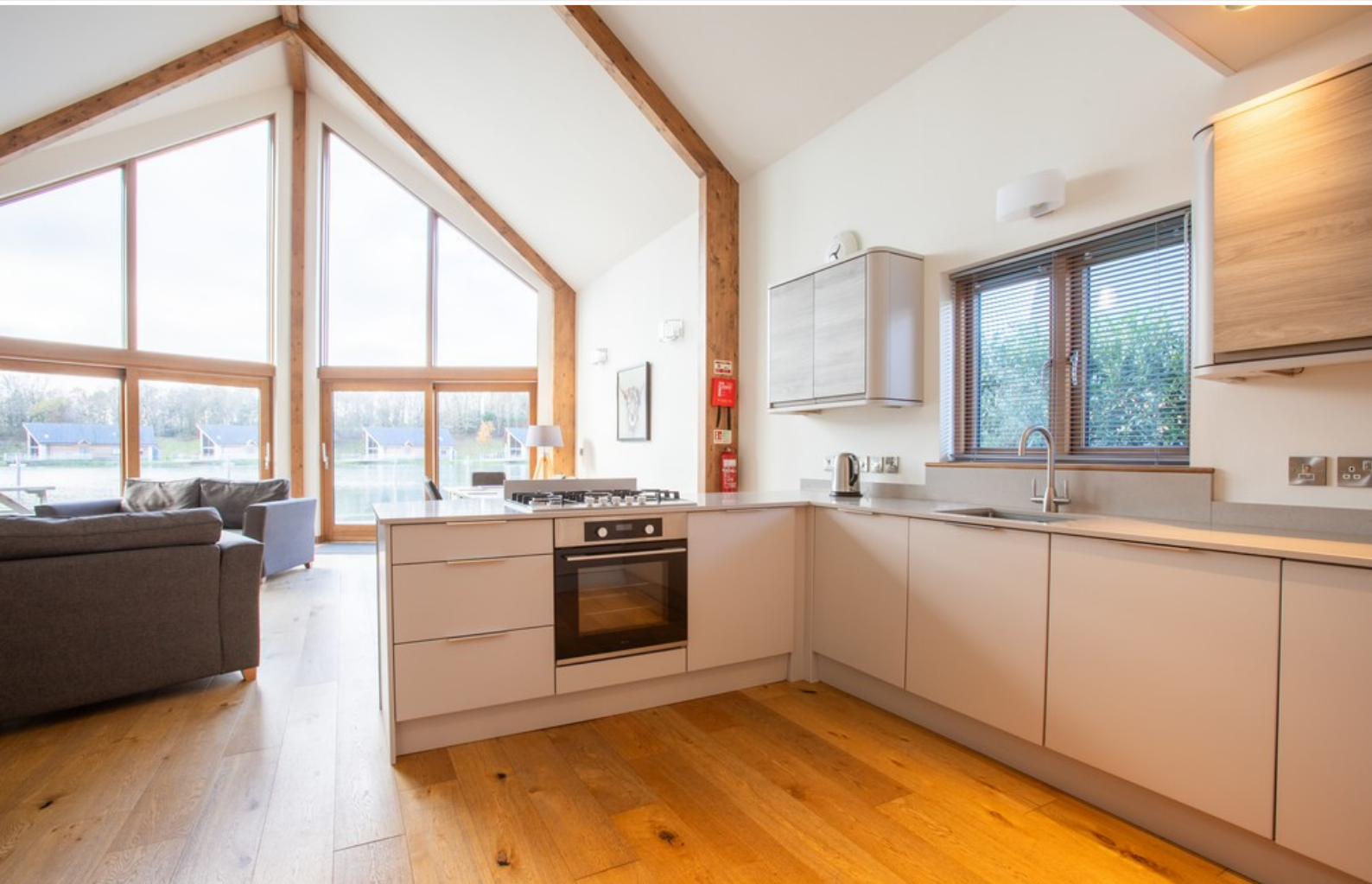
Open Plan Living Dining Kitchen