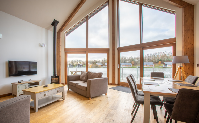
Open Plan Living Dining Kitchen