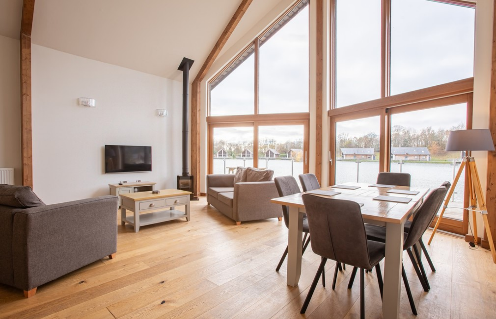
Open Plan Living Dining Kitchen