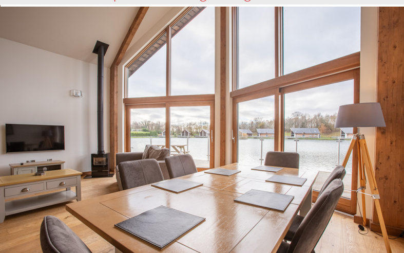
Open Plan Living Dining Kitchen