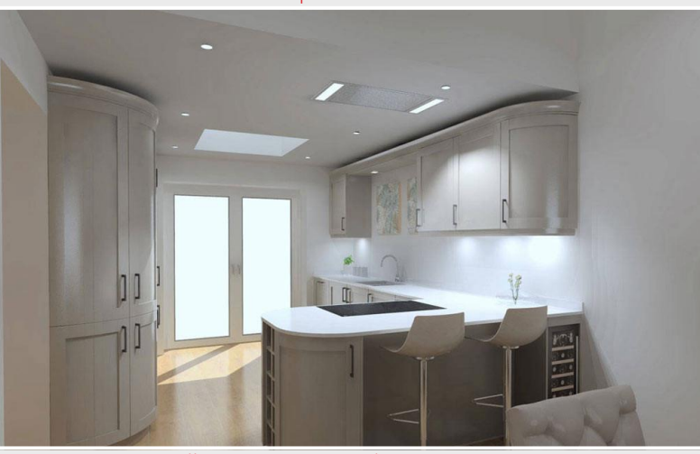
Illustration of Kitchen Designs