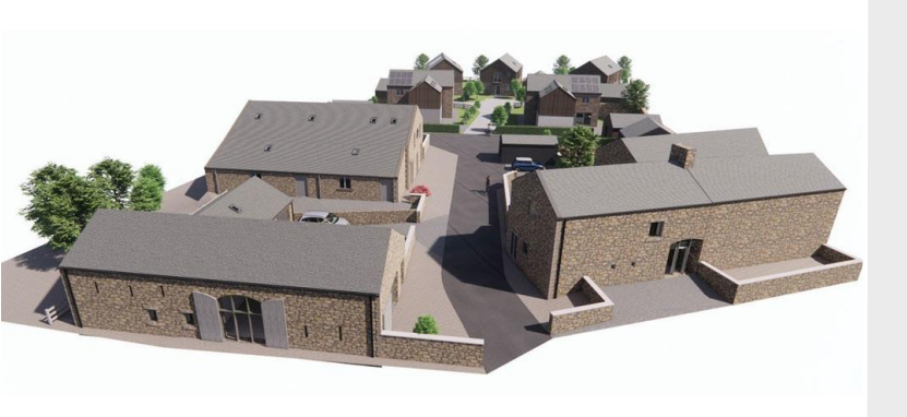
Illustration Of Old Hall Development