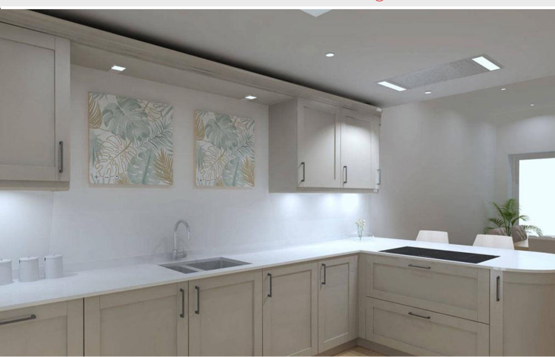
Illustration of Kitchen Designs

Location Welcome to Over Kellet, a charming village nestled in the Lancashire countryside. Here, you'll find a harmonious blend of natural beauty and a warm community atmosphere, creating the perfect setting for your new home.