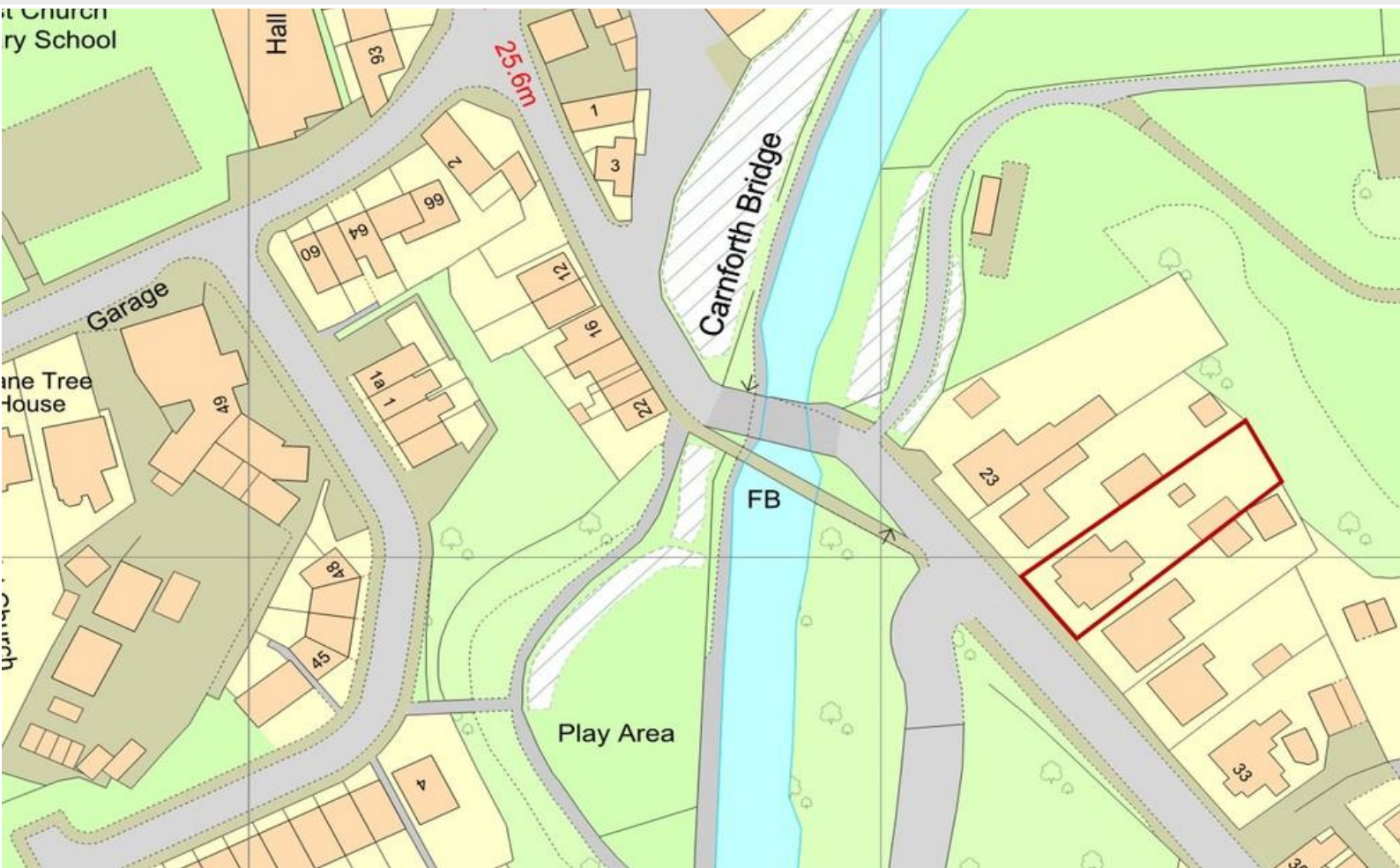
2023 OS Map - 01103163

Request a Viewing Online or Call 01524 737727