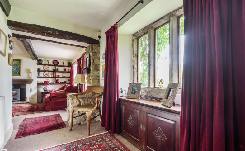
Hallway through to Living Room