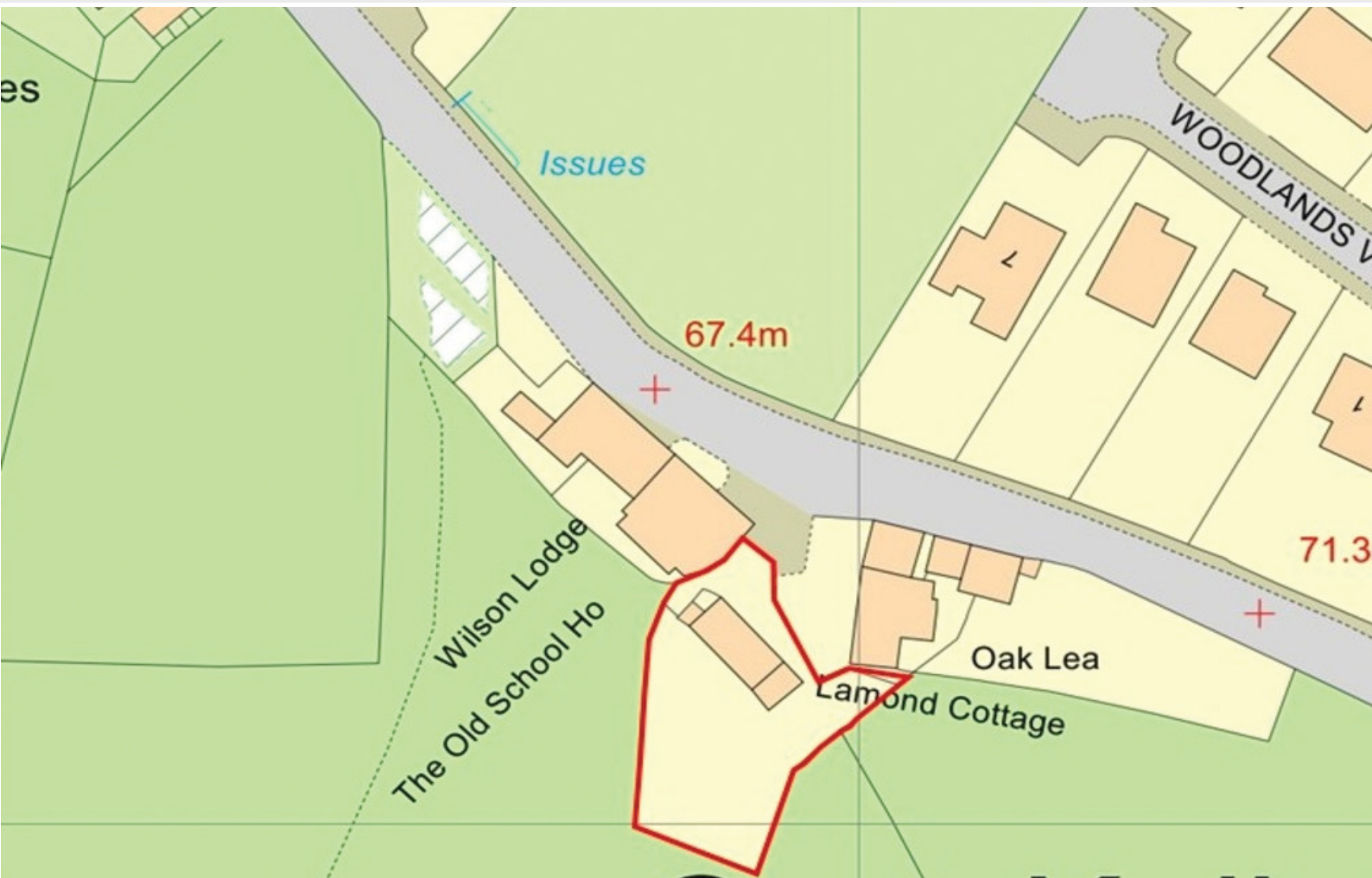
Ordnance Suvey Map - 01054465

Request a Viewing Online or Call 01524 737727