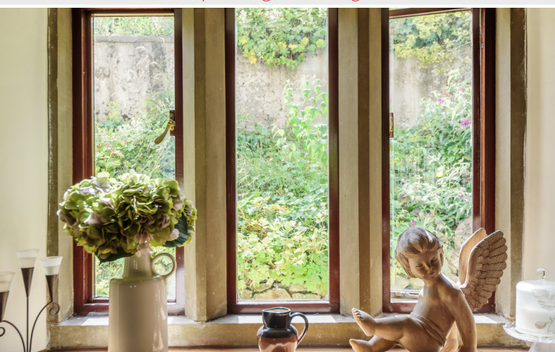
Mullion Stone Windows