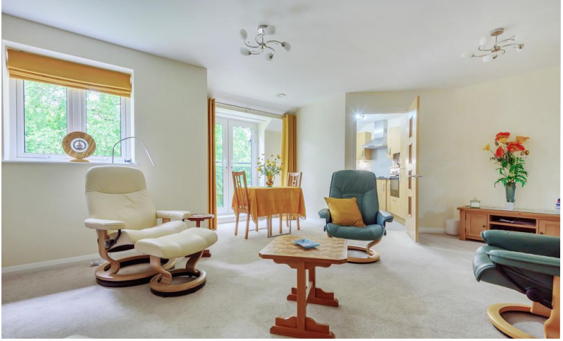
Open Plan Living/Dining Room