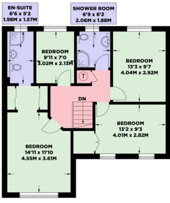
First Floor 759 sq Ft / 70.5 sq M