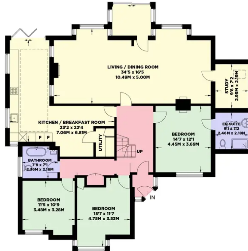
Ground Floor 1880sq Ft / 174.7 sq M