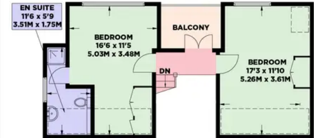
First Floor 443 sq Ft / 41.2 sq M

© Mansell McTaggart 2024 Floor plan is for illustration and identification purposes only and is not to scale. Plots, gardens, balconies and terraces are illustrative only and excluded from all area calculations. All site plans are for illustration purposes only and are not to scale. This floor plan has been produced in accordance with Royal Institution of Chartered Surveyors' International Property Standards 2 (IPMS2). Every attempt has been made to ensure the accuracy however all measurements, figures, fittings shown is an approximate interpretation for illustrative purposes only.