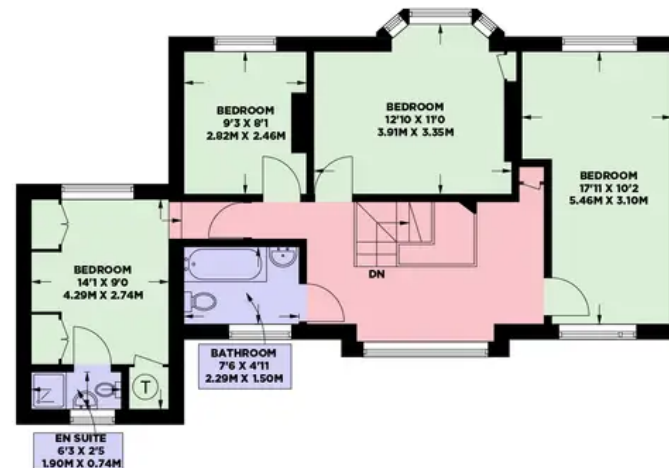
First Floor 724 sq Ft / 67.3 sq M

Floor plan is for illustration and identification purposes only and is not to scale. Plots, gardens, balconies and terraces are illustrative only and excluded from all area calculations. All site plans are for illustration purposes only and are not to scale. This floor plan has been produced in accordance with Royal Institution of Chartered Surveyors' International Property Standards 2 (IPMS2). Every attempt has been made to ensure the accuracy however all measurements, figures, fittings and fixtures shown is an approximate interpretation for illustrative purposes only.