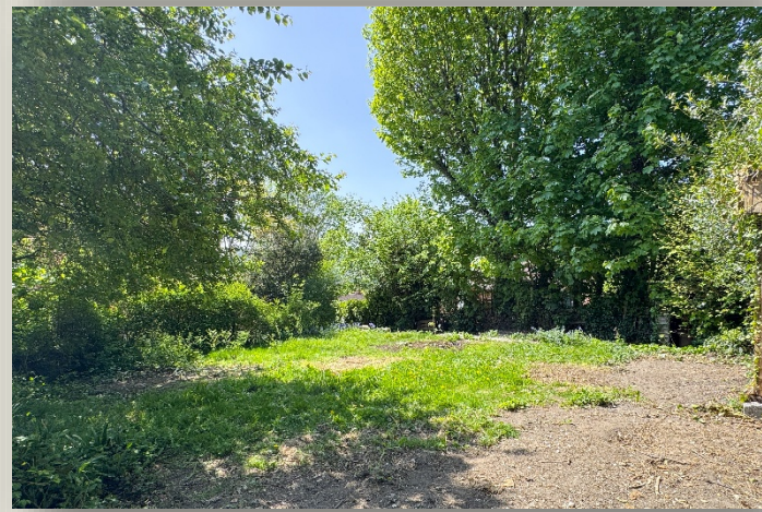
Viewing is Strictly by Appointment through Reaston Brown