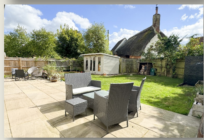
Viewing is Strictly by Appointment through Reaston Brown