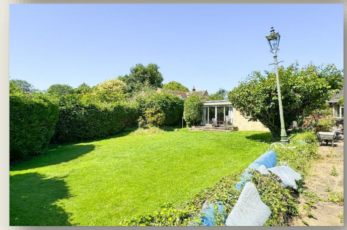
Viewing is Strictly by Appointment through Reaston Brown