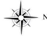
Apartment 3, The Old Grain Store, Thame, Oxfordshire, OX9 3BH

All measurements of walls, doors, windows and fitting and appliances, including their size and location, are shown as standard sizes and therefore cannot be regarded as a representation by the seller.