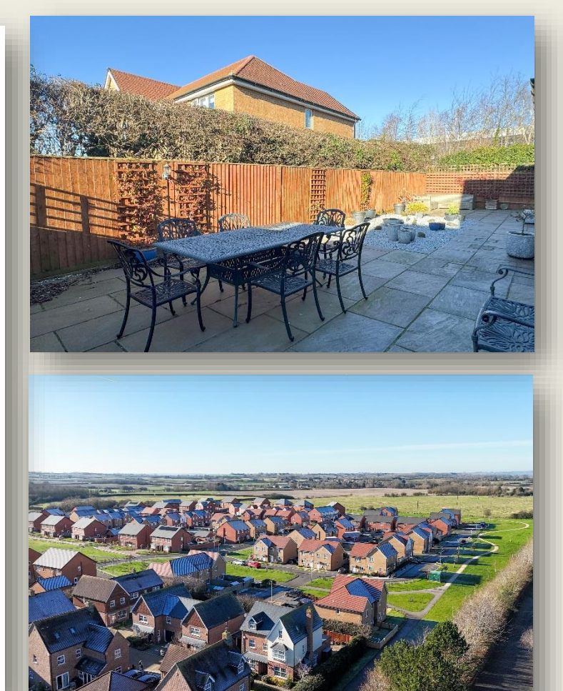
Viewing is Strictly by Appointment through Reaston Brown