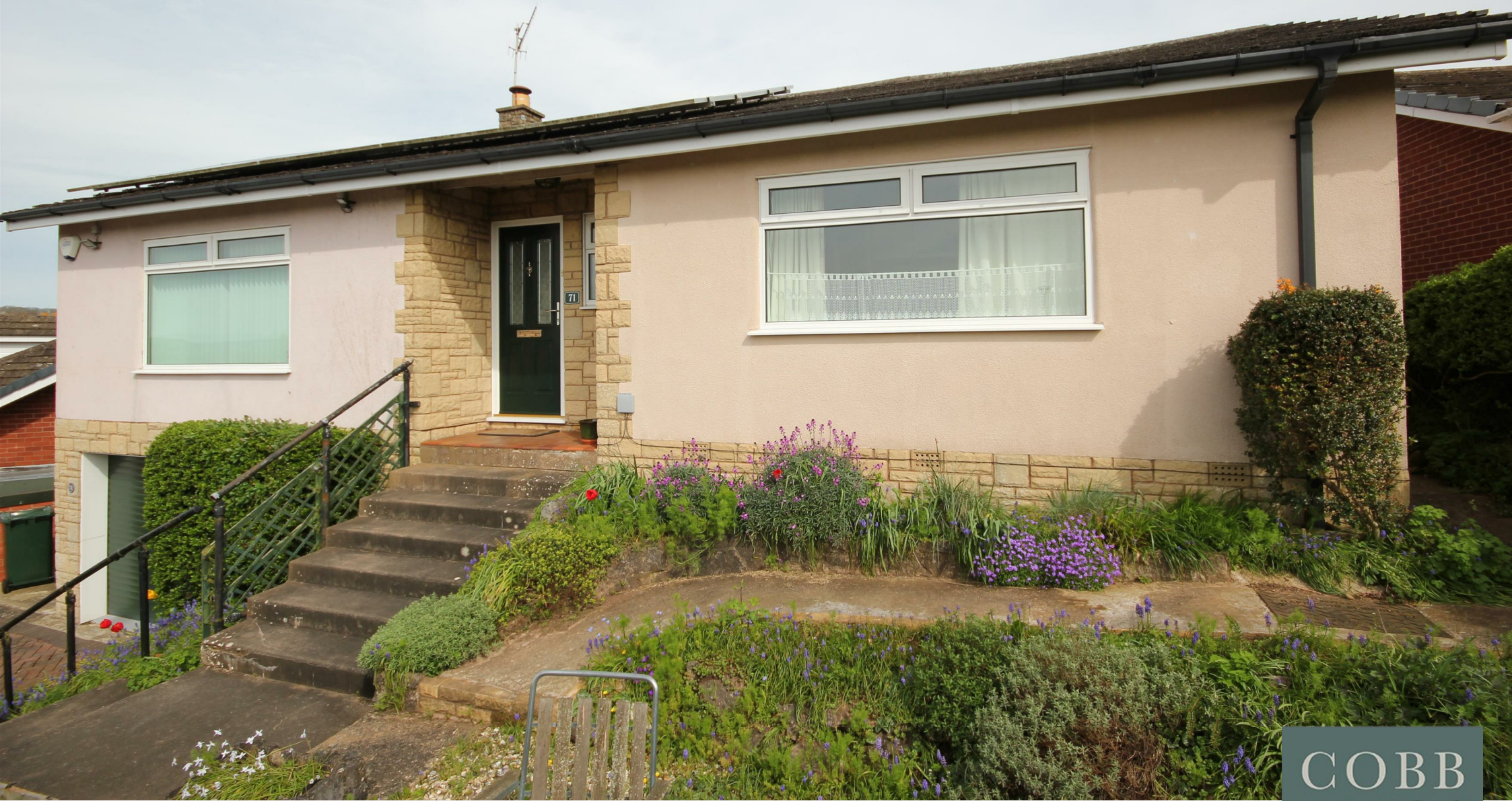
71, Bringewood Rise, Ludlow, SY8 2NE Price £375,000