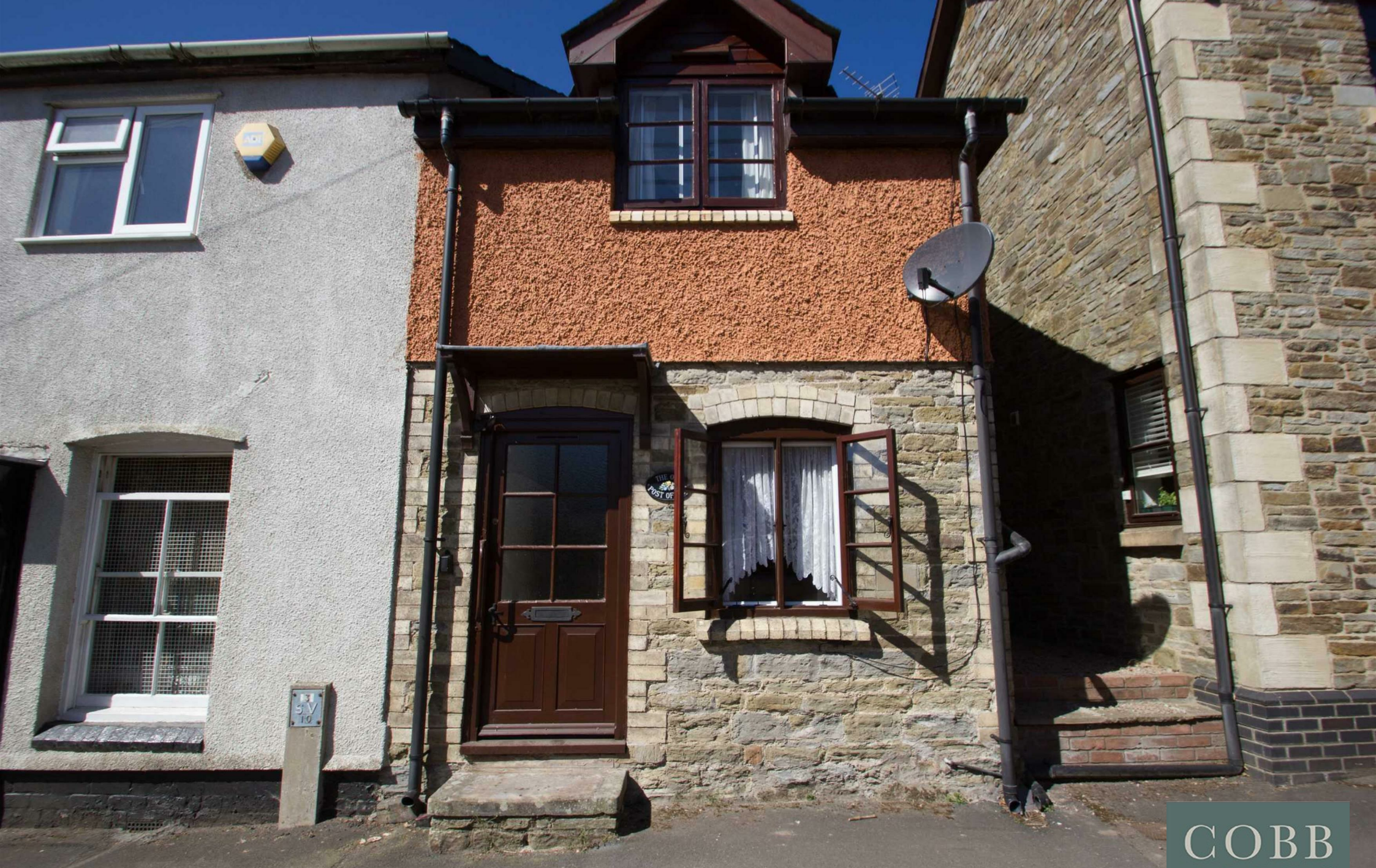
The Old Post Office, Watling Street, Leintwardine, SY7 0LW Price £180,000