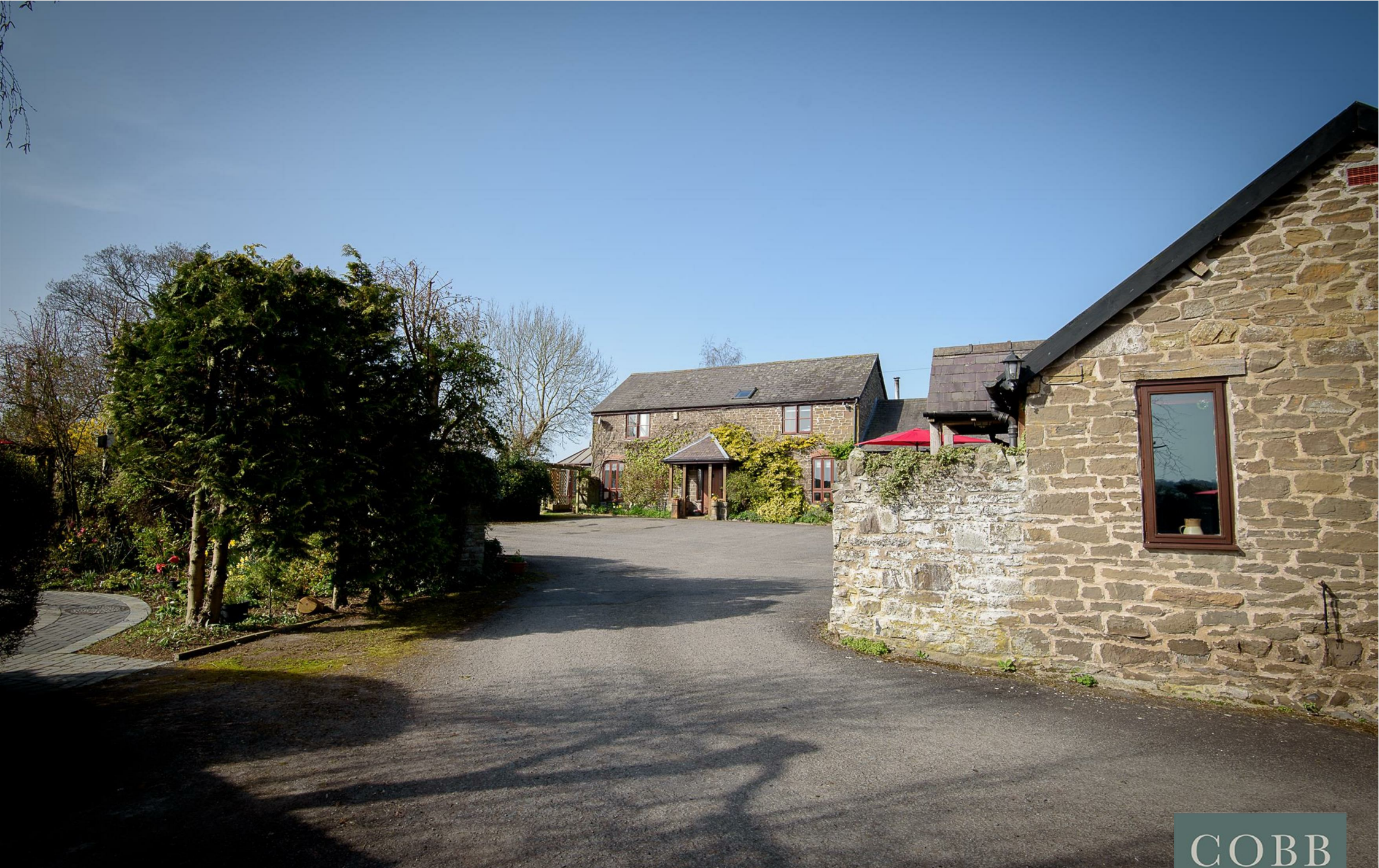
Highgrove Farm, Long Lane, Craven Arms, SY7 8DU Price £800,000