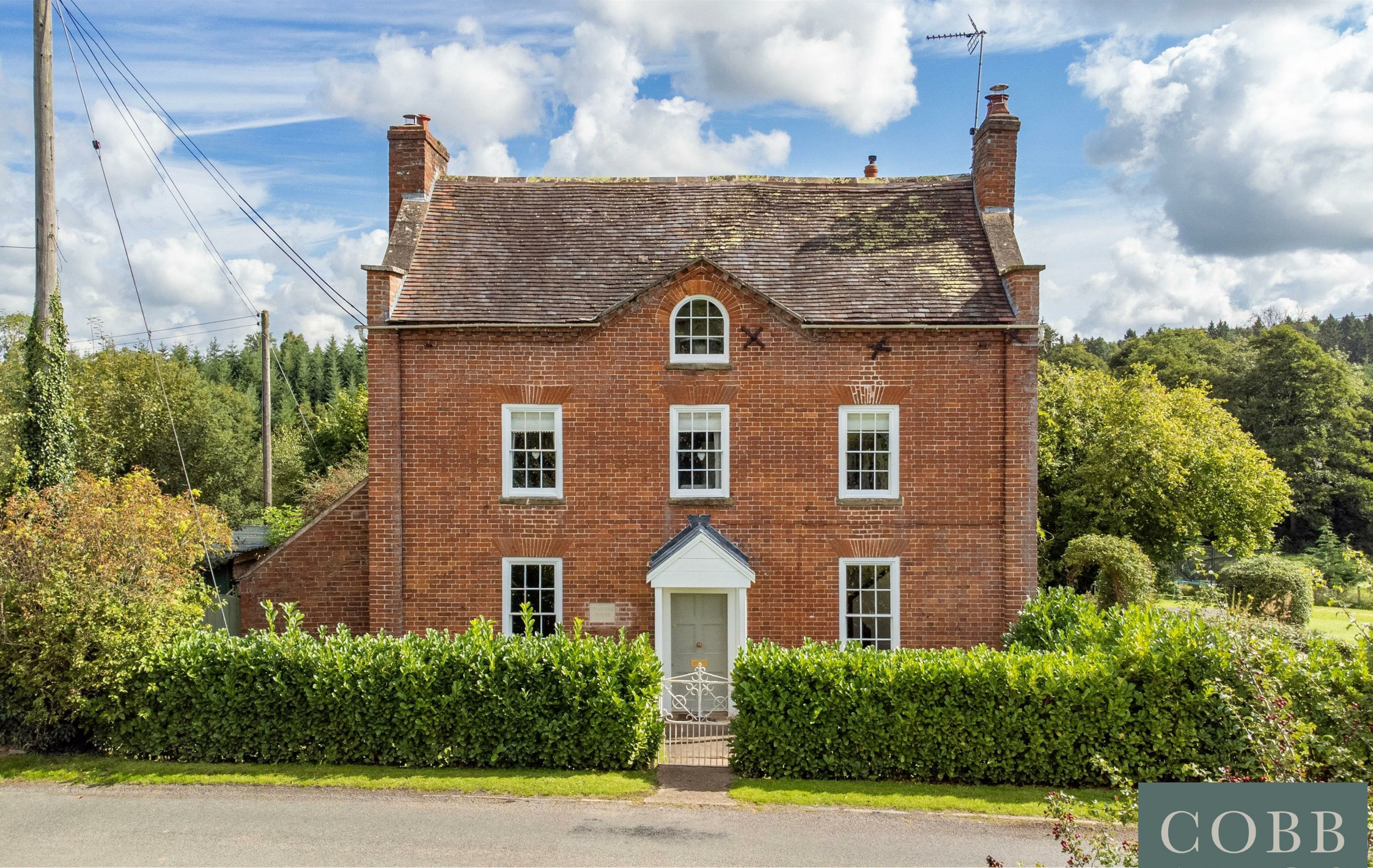
Nineveh House, Tenbury Wells, WR15 8RN Guide Price £750,000