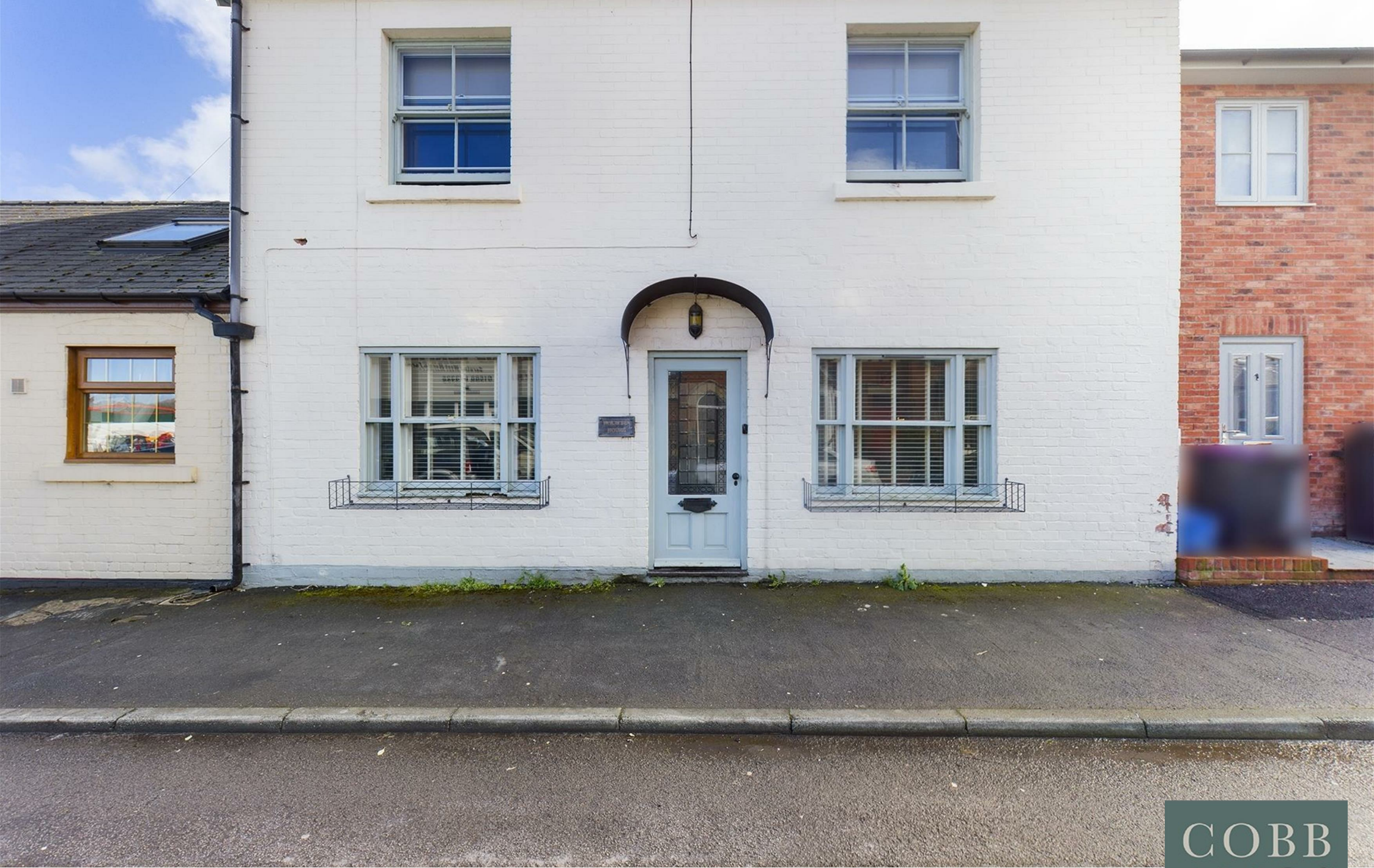
Holborn House, Dale Street, Craven Arms, SY7 9NY Guide Price £250,000