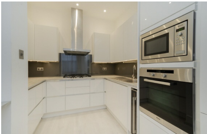
Devonshire Place, W1G