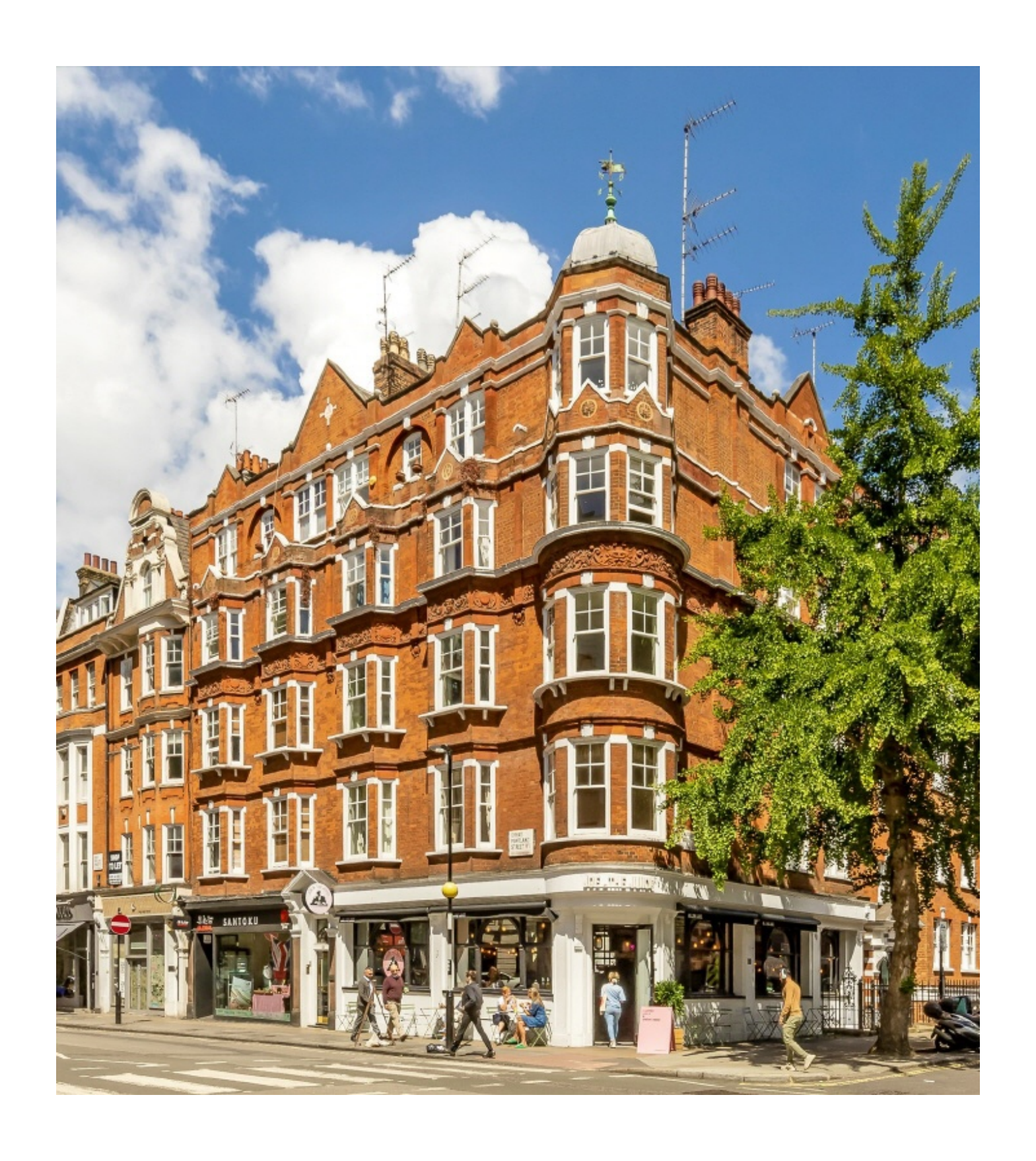
Great Portland Street, W1W £800,000