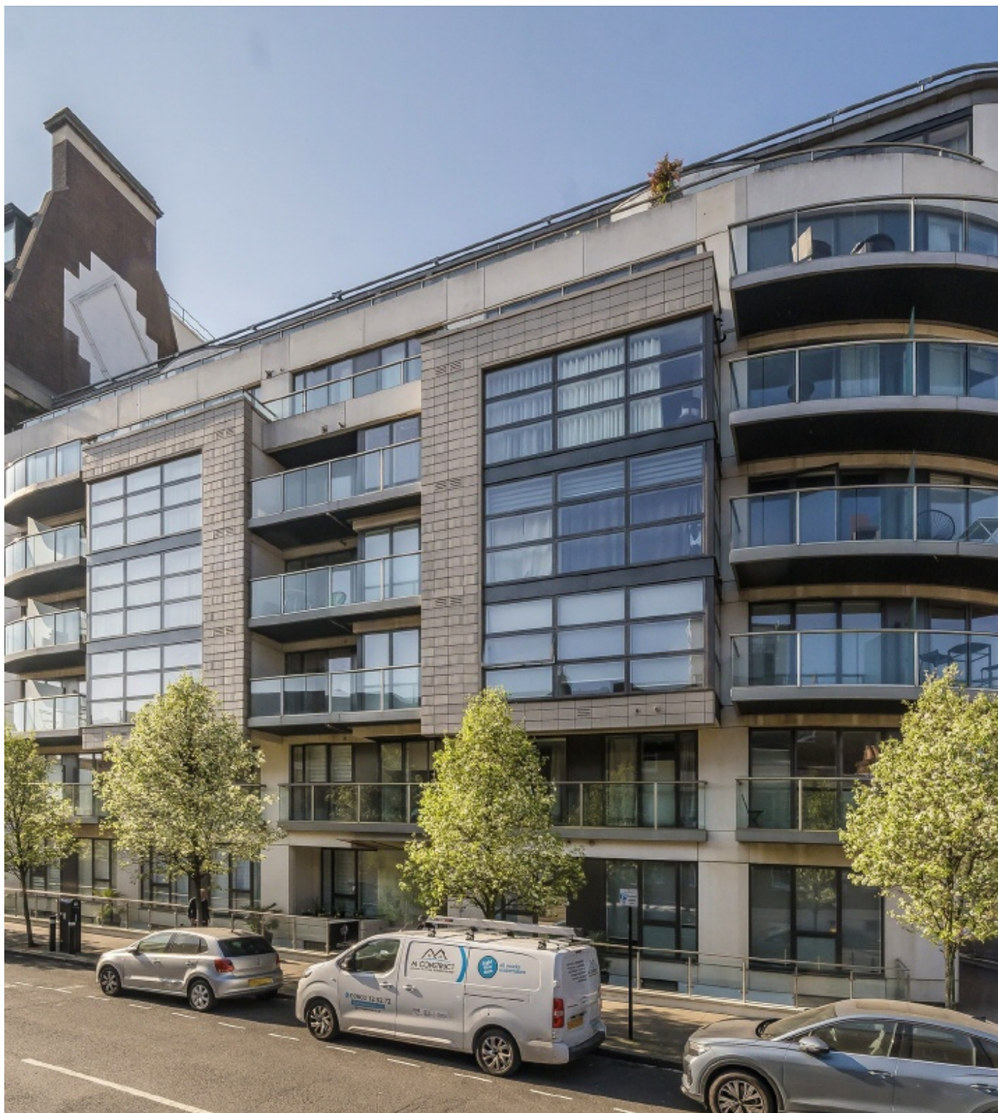
Allsop Place, NW1 £1,799,000