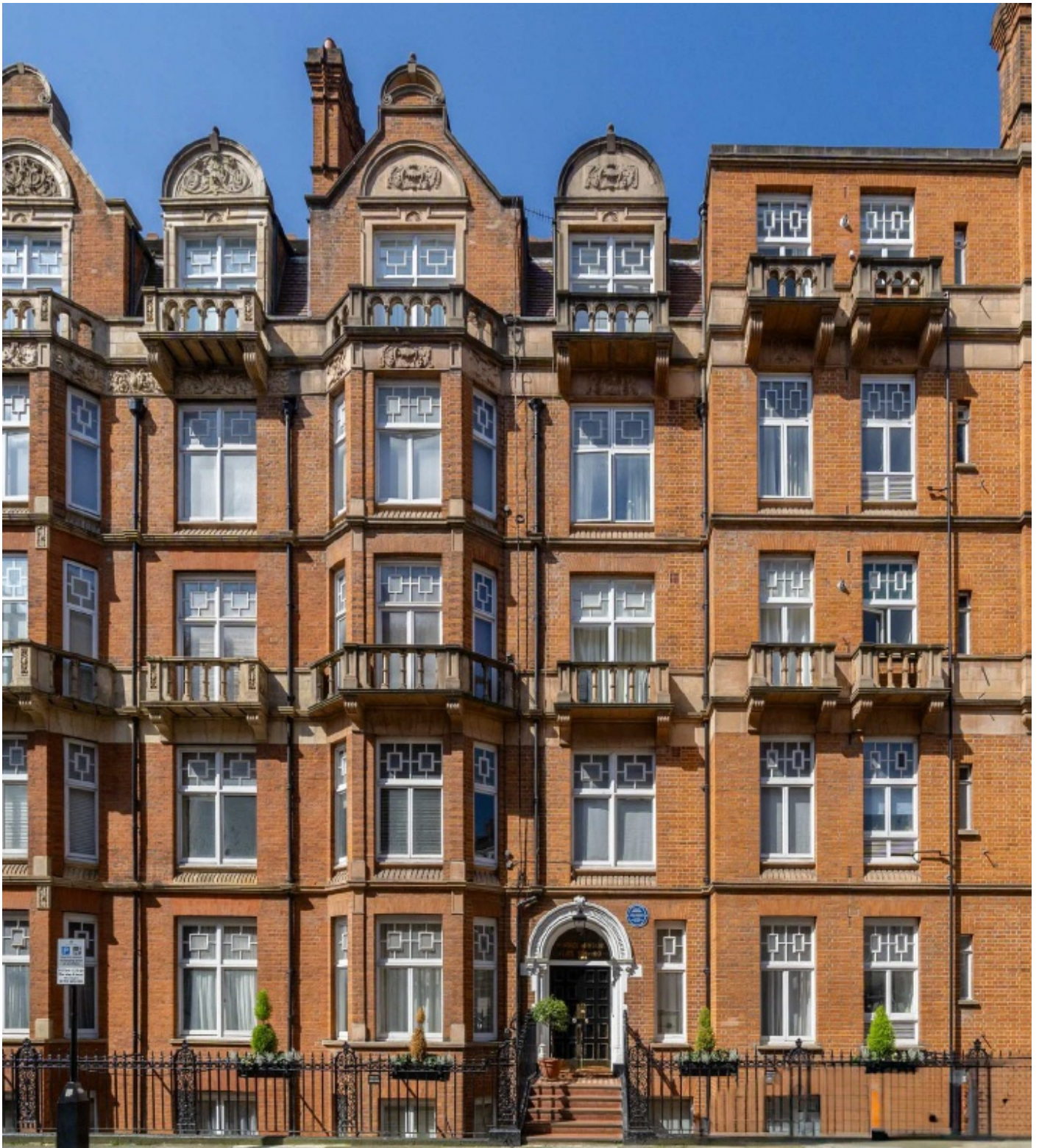
Montagu Mansions, W1U £3,700,000