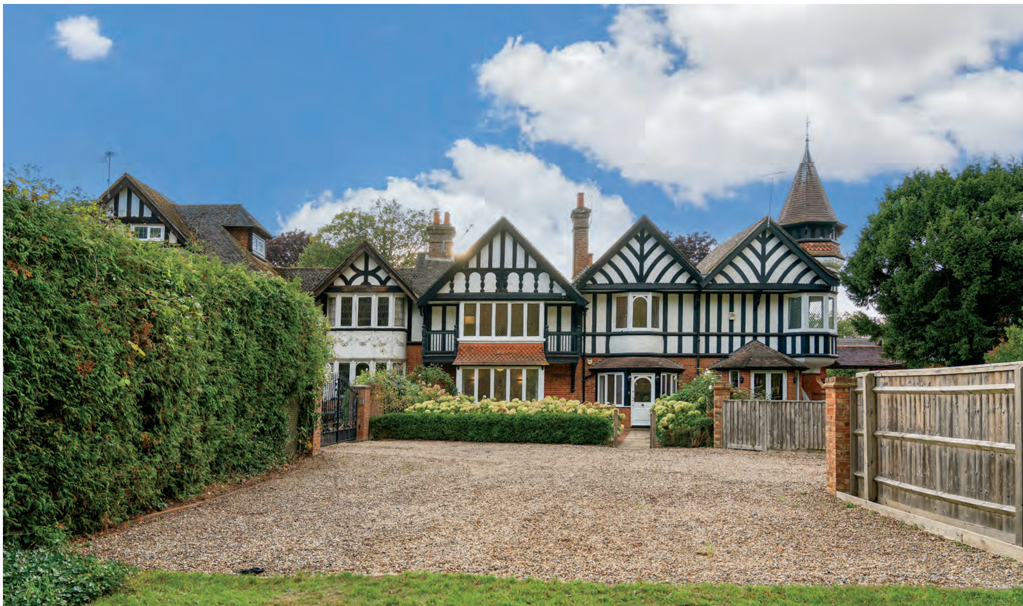
Battlemead House 58 Lower Cookham Road | Maidenhead | Berkshire | SL6 8JZ