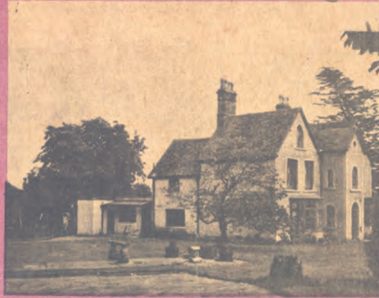
ABOVE: The Manor House — a view from the grounds.