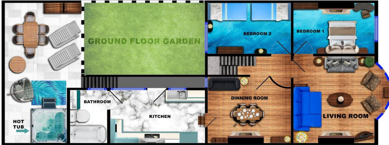
LUXURY GEORGIAN APT