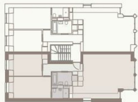
Apartment 6 First Floor