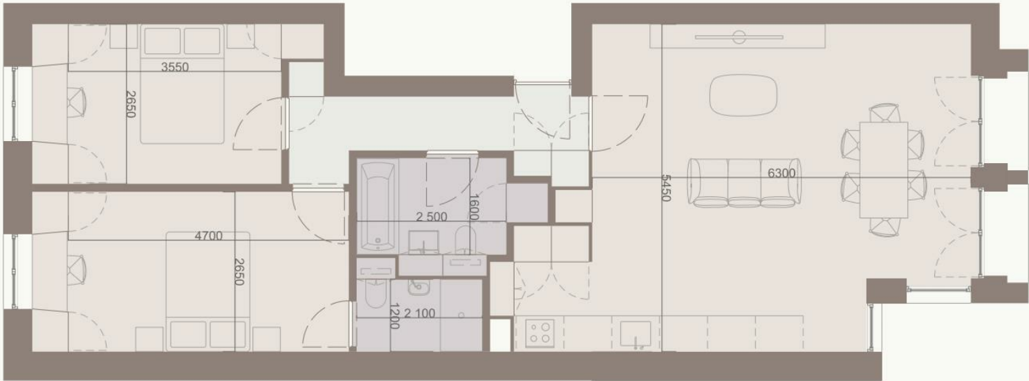
Apartment 6 First Floor